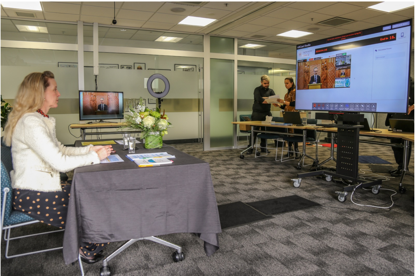
View from the facilitators table, with a sneak peek behind the scenes.