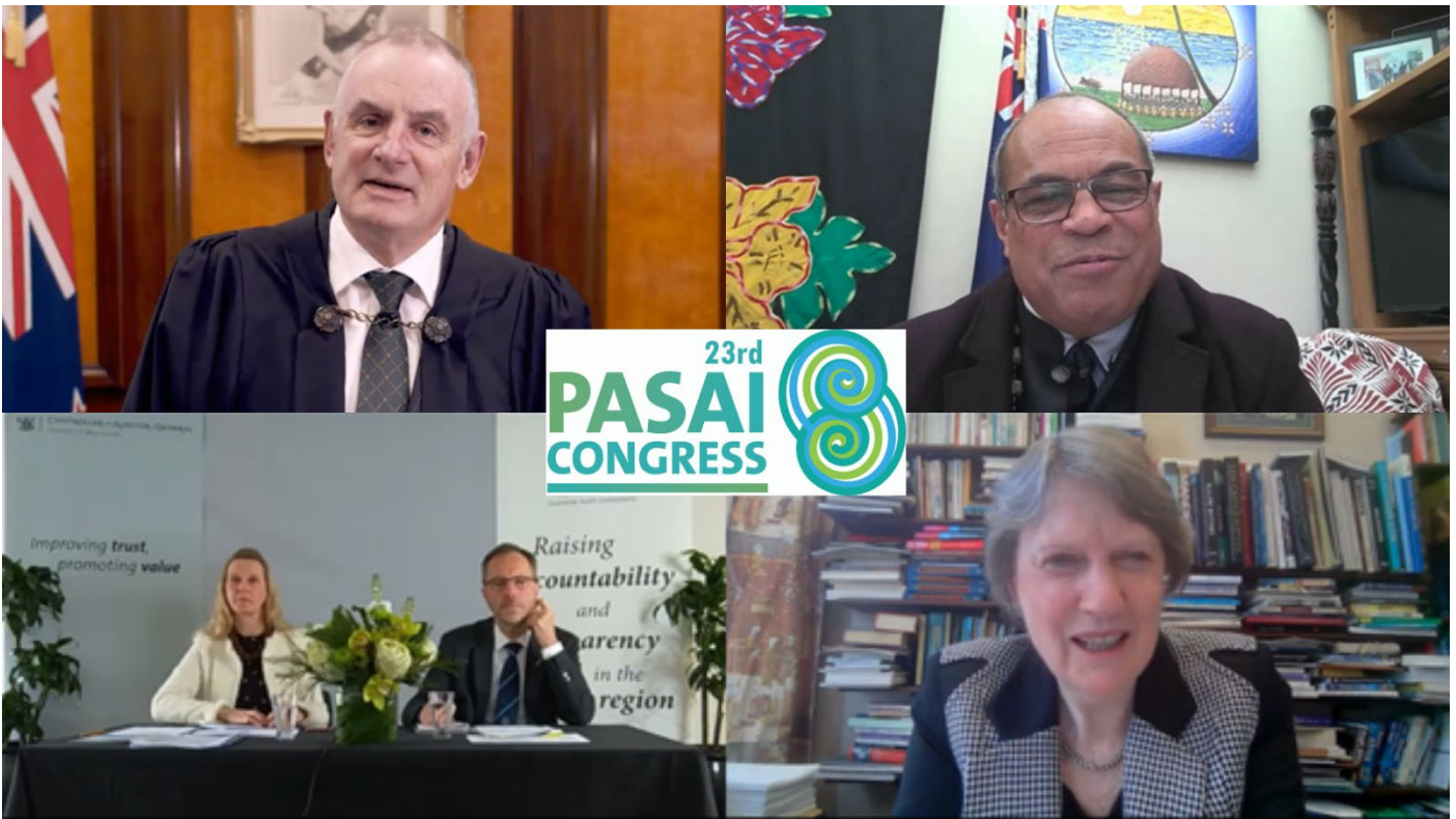
Composite of Day 1 speakers, including the Right Honourable Trevor Mallard, the Honourable Aupito William Sio, and the Right Honourable Helen Clark.