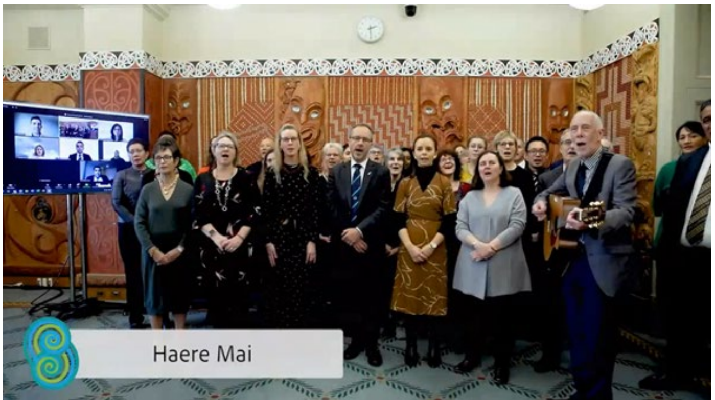
'Haere Mai' (welcome song) by the Office of the Auditor-General (New Zealand) Leadership Team, Waiata Group and PASAI Secretariat.