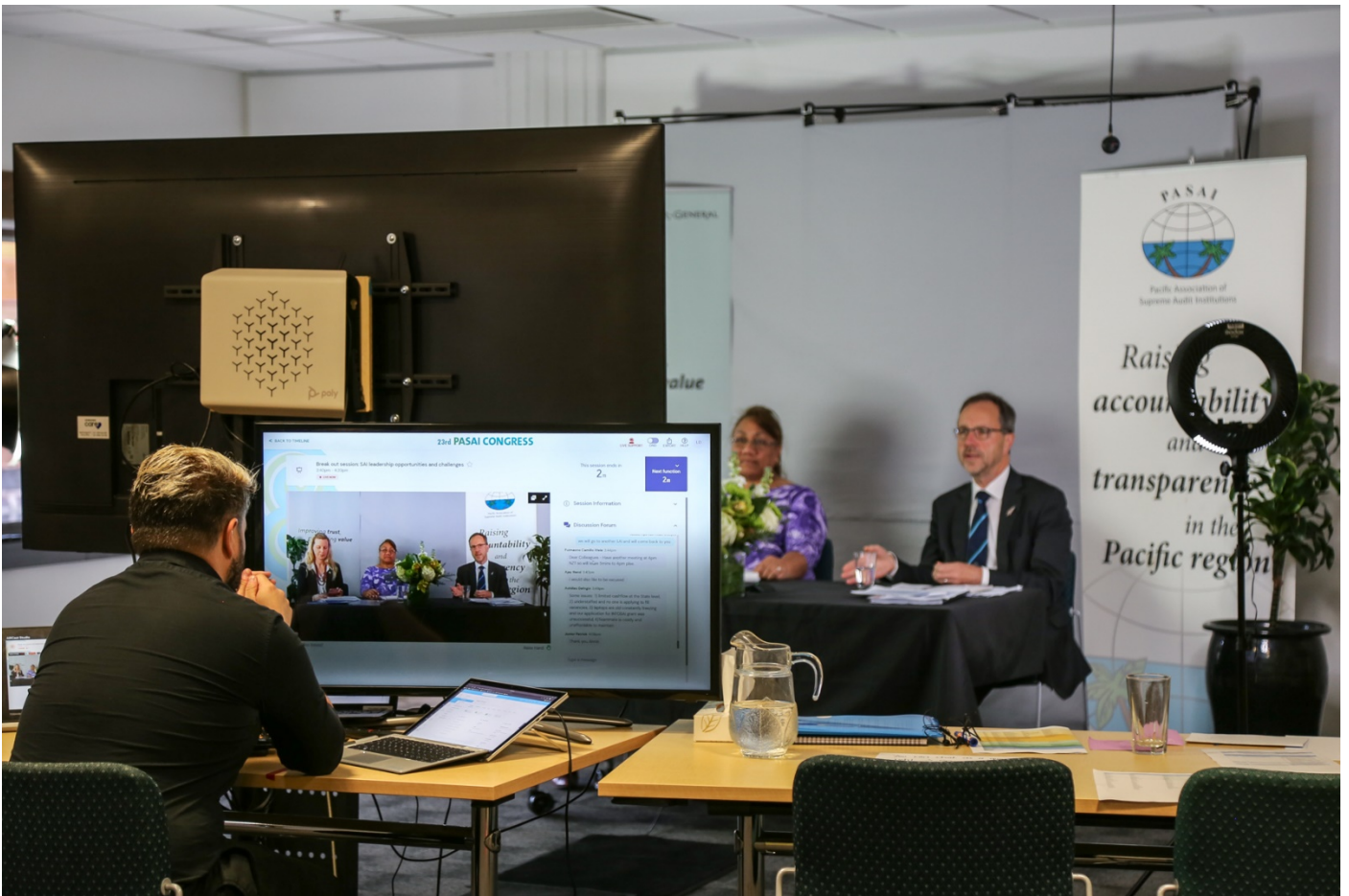
Live broadcasting from the New Zealand Office of the Auditor-General's Wellington office.