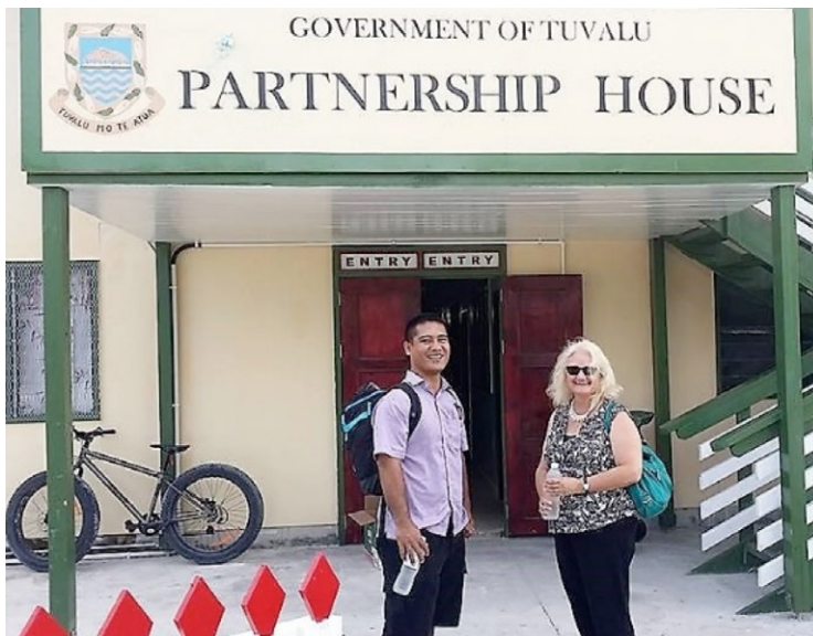
Head of Internal Audit Tuvalu with GIZ Technical Advisor