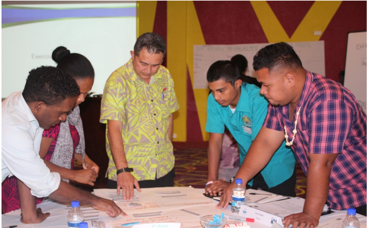
Participants from Solomon Islands, Vanuatu, Samoa, Nauru and Tuvalu working on an exercise during the workshop