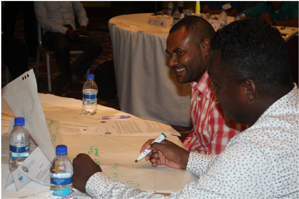
Delegates from PNG and Solomon Islands during workshop exercises