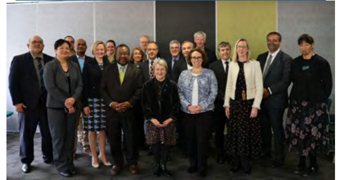
ACAG business meeting participants

As the host of the meeting, we took the opportunity to place two issues on the meeting agenda that we deemed to be important for ACAG members to consider. The first was the work our office is doing to address our strategic intention Enhancing our impact in te ao Māori (the Māori worldview). And the second item was actions needed to fully activate the potential of twinning partnerships in PASAI's next strategic period.