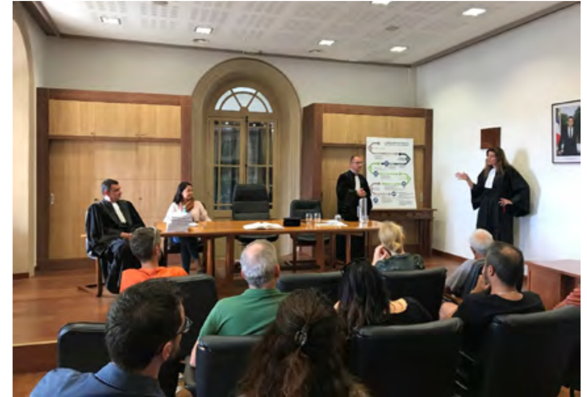
Visitors listening to a presentation about the Chamber's mission and workflow

The following day, the Chamber opened its office to the general public. About 60 members of the public passed through. As well as the historical visit, they were particularly interested in understanding the Chamber's working methods and its selection of subjects. Some of the reports that had received recent coverage in the local press were presented in greater detail by the magistrates present.